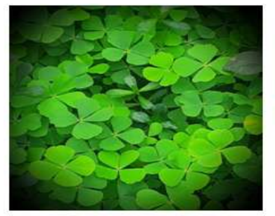
Fig. 1: Dwarf water clover